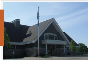
Darien Public Library

[post news of current events at the library]